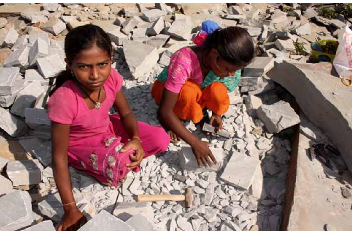
Children working in a quarry in Rajasthan, India: often their parents are indebted to the quarry owner

There are several programmes at the country and federal state level for documenting and ending forced labour, people trafficking and exploitative child labour and for rehabilitating and compensating the victims. These programmes also gather data on the current situation, which are, however, not aggregated and made publicly available. The lack of power to enforce the initiatives and the insufficient mutual cooperation are repeatedly criticised (USDOL 2012a: 329ff.; CRY 2013: 7, 38; UNODC 2013: 29-60). Thus although positive approaches to the combating of forced labour and child labour are indeed already to be seen, nonetheless very much still remains to be done.