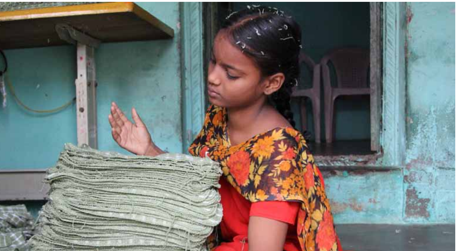
Far removed from any control: many children work in so-called home based-units

The factories in which children work are often located in cellars since the rooms cost less and the children do not attract attention there. The workplace is often simultaneously also the workers' cramped living and sleeping space. They work without daylight and under poor hygiene conditions. Payment is made on a piecework basis, however, the payment is set so low that the boys have to work extremely long hours to make ends meet. In one documented case, the workers earned only 7 rupees per finished shirt and would have had to work 18 hours a day to earn the legal minimum wage (ASI 2012: 12). In Delhi there are state inspections to combat child labour, but the inspectors are regularly bribed, so that hardly any cases are discovered or ended.