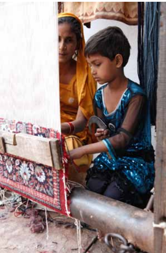
Carpet production in private homes: Often a result of debt bondage of the family