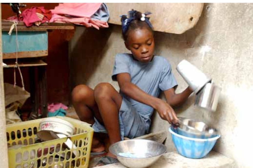
In Cité Soleil, the largest slum of Port-au-Prince, 40% of all children are restaveks: they often become victim of sexual abuse

On the other hand, a survey shows that by no means all restaveks feel badly off. From the children's point of view the picture is mixed. Some children even feel better off in the employer's family than in their own biological family and report good treatment and regular school attendance (USDOL 2012: 30 ff).