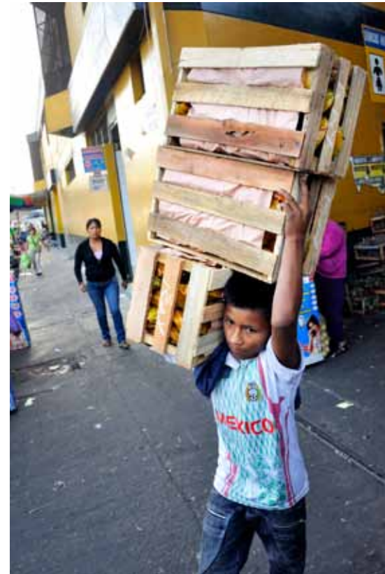
Peru: 11-year old porter at the market in Lima

This simple definition is the essence of the multitude of regulations by the United Nations and the ILO. It is precisely this diversity and multitude of agreements that show that forced labour of children and adults has been outlawed for decades, but at the same time is still widespread, and the international community is trying to bring this under control through more regulations.