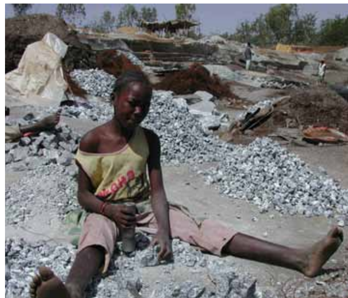
Burkina Faso: Girl working in stone quarry

In spite of the many open questions concerning the overall picture, there are already answers in some areas. These include the definitions of forced labour of children explained in the second chapter and international regulations which are intended to prevent this. In the third chapter, the existing data is summarised, but readers should always be aware that with the present state of research these are in all cases guide values, but not yet precise figures. In the fourth chapter, it is shown on the basis of case examples how diverse the manifestations of forced labour are in different states and regions. The study closes with a call for governments, companies and non-governmental organisations to work together to combat forced labour for both children and adults.