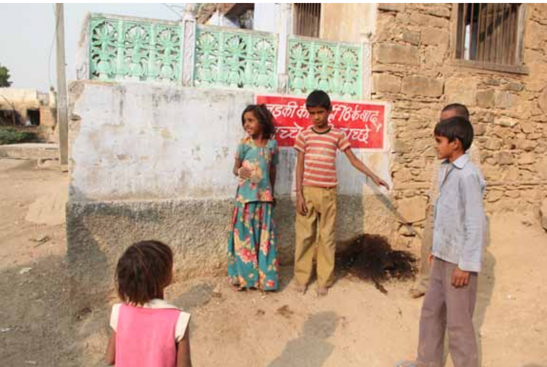
Children in Rajasthan in front of a wall with the text: "Girls, marry when you're 18 and get children at 21".