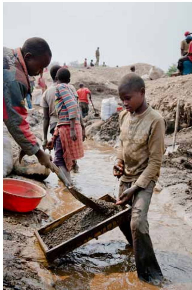
Hazardous labour: children working in a copper mine in Katanga, DR of Congo

During the civil war it could sometimes be openly observed that militias or government groups had forced people into the work. In spite of the pacification of the major part of the mining areas, forced labour still seems to be the order of the day, as is confirmed by a study from 2013. In the province of South Kivu, surveys were carried out in several mining areas, in which about 2,500 people are working, and looked for forms of forced labour. Among the 931 persons specifically selected and interviewed in detail, 866 could not freely decide whether they wished to continue working in the mines. Again, 203 of these, i.e. 23%, were younger than 18 years. Most of them had migrated into the mining areas from adjacent regions. Two thirds of these children are subjected to the worst forms of child labour. The work is very hazardous to health. Girls are also at risk of being forced into marriage or prostitution (Free the Slaves 2013: 13-20).