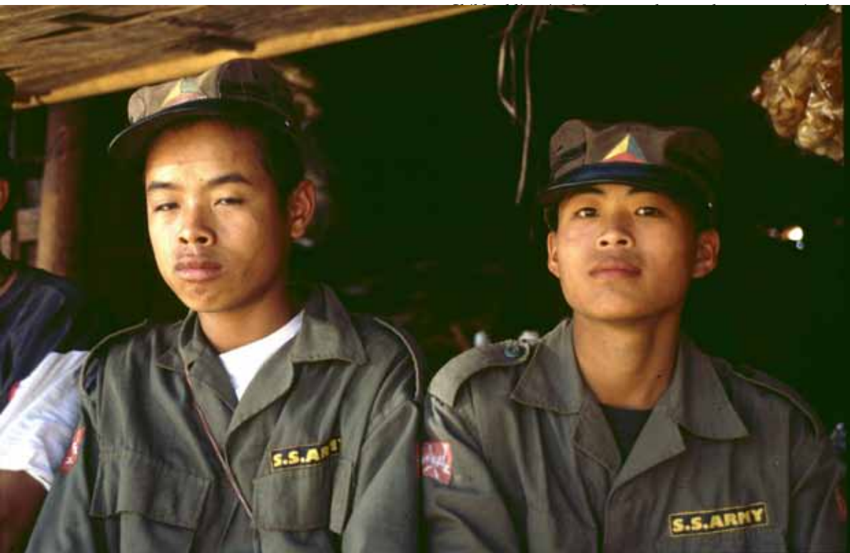
Child soldiers in Myanmar: cheap and easy to manipulate

In view of the unclear situation in many war regions, there is no precise information about the numbers affected. The German Coalition to Stop the Use of Child Soldiers estimates that there are 250,000 children used as soldiers worldwide. In the DR of Congo alone, there were at least 10,000 in recent years.