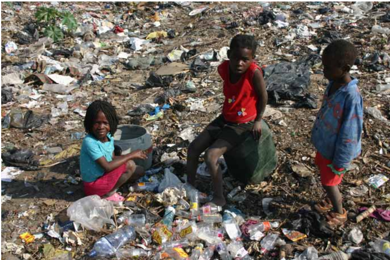
Waste dump in Mozambique: Children collect and sell recyclables

Persons up to the age of 18 years are regarded as children and for this age group it is stipulated that any kind of “recruitment, transportation, transfer, harbouring or receipt of a child for the purpose of exploitation” is regarded as trafficking in persons, even if no direct coercion is applied in the process (UN 2000).