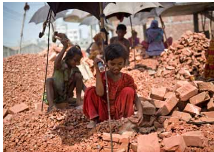
Bangladesh: children are cutting stones

Although forced labour imposed by the State generally lasts for a relatively short time (7 months), the period of time spent in sexual exploitation (17 months) or working in the private sector (19 months) is much longer. From the little data available, it can be seen that half of the known cases of forced labour last for less than half a year (Table 6). However, the ILO assumes that the period of time spent in forced labour for cases that have not yet been discovered is twice as long as with discovered cases, lasting for an average of around 29.4 months (ILO 2012a: 37-38).