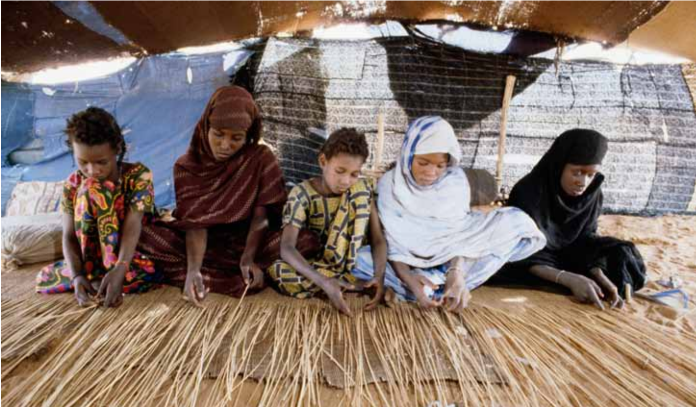
Born as slaves: girls in Mauritania are weaving mats