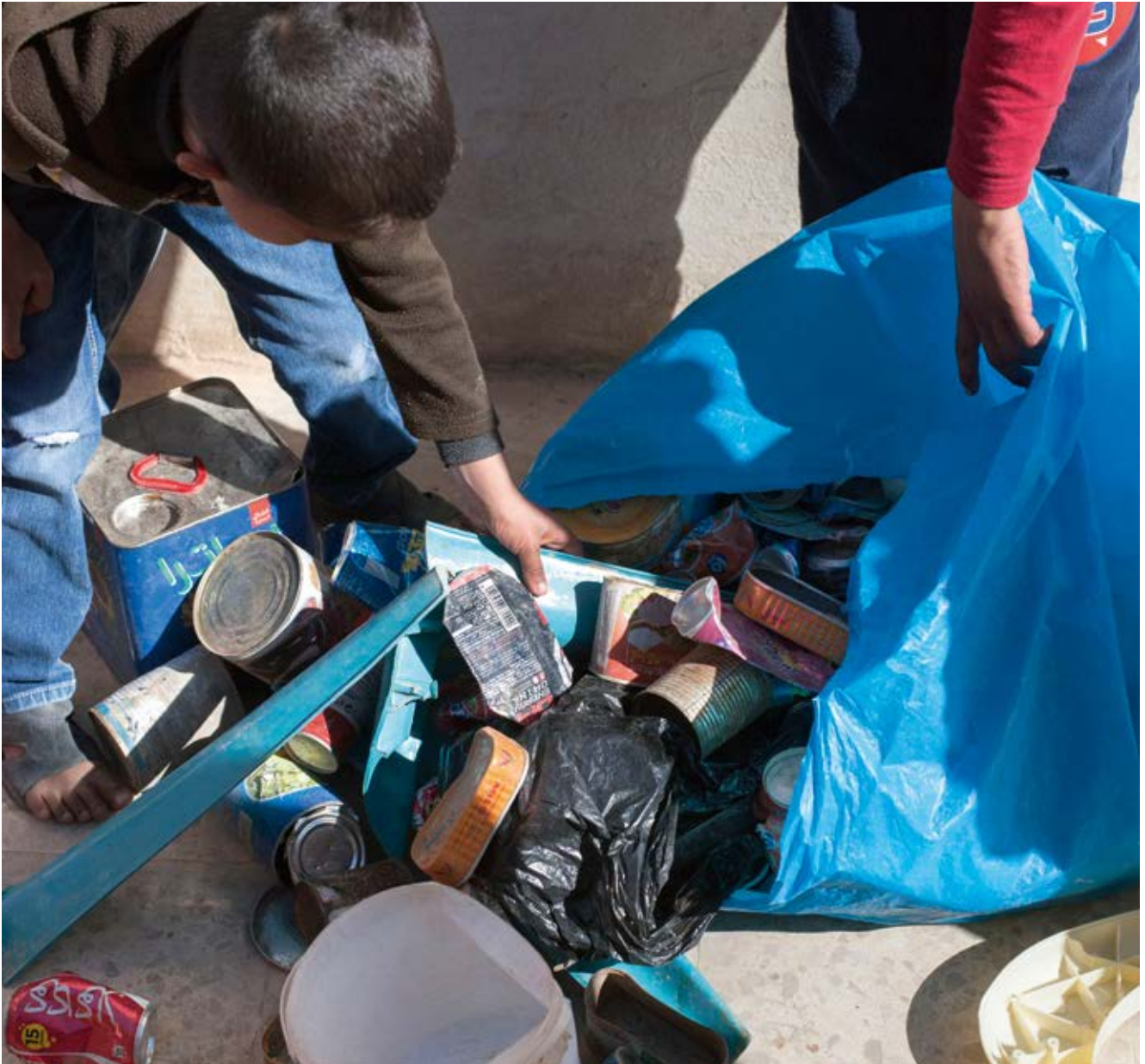
Children collecting scrap metal in a Jordanian refugee camp

think that working children are beggars when selling at traffic lights. « Similarly, religious values play an important role when boys define the types of work that they should not do. For example, a group of boys explained that they »should not do illegal trade such as alcohol, prostitution, stealing because it is against Islam.« 77