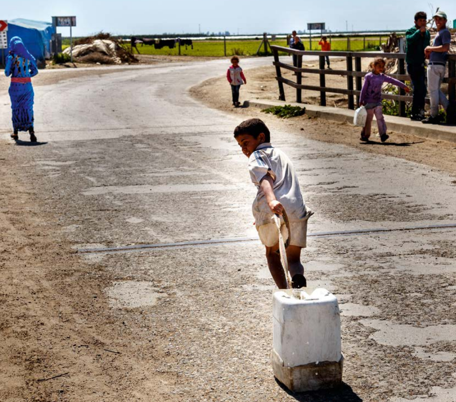
Child labour near a refugee camp

Until October 2015, most refugees headed on to Europe via Macedonia, Serbia and Hungary after passing through Greece. Since the closure of the Hungarian border in October 2015, the flow has been through Croatia, Slovenia and Austria. All countries along the Balkan Route are not only struggling with the high influx of refugees but also with the socio-political impact. Greece was hit hard by the deep economic recession which started in 2010 and which has severely affected the living conditions of the Greek population. According to EU information, the overall risk of poverty and/or the social exclusion rate reached 36 % in 2014.