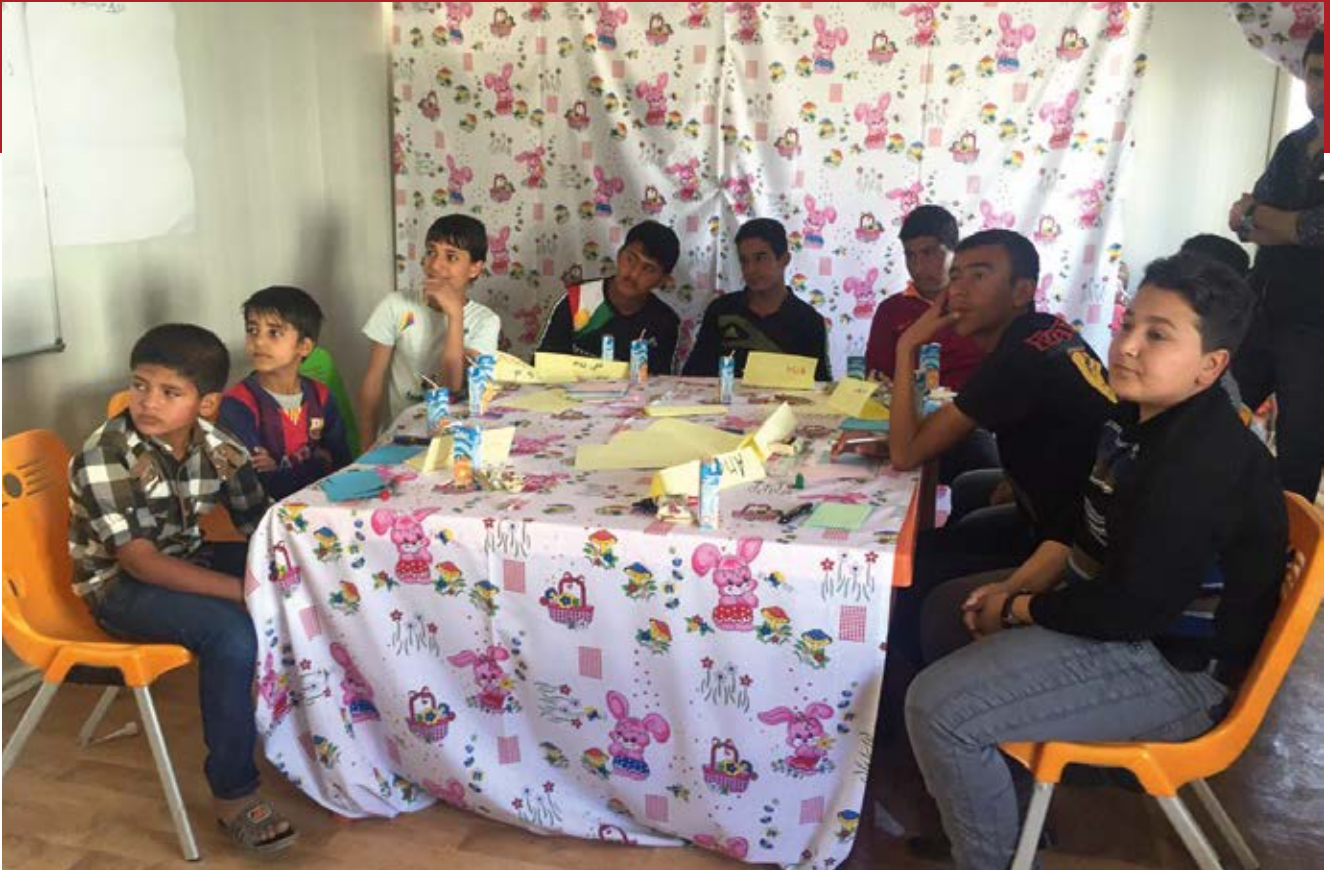
Northern Iraq: Workshop with children in a terre des hommes Italy project

reported that their main reason for working was to support their families. According to them, poverty and having family members who are unable to work are the main determining factors for child labour. Besides this, the children reported that strong family values, peer pressure and prejudiced views on education also prevented them from attending school – pushing them into child labour. 161