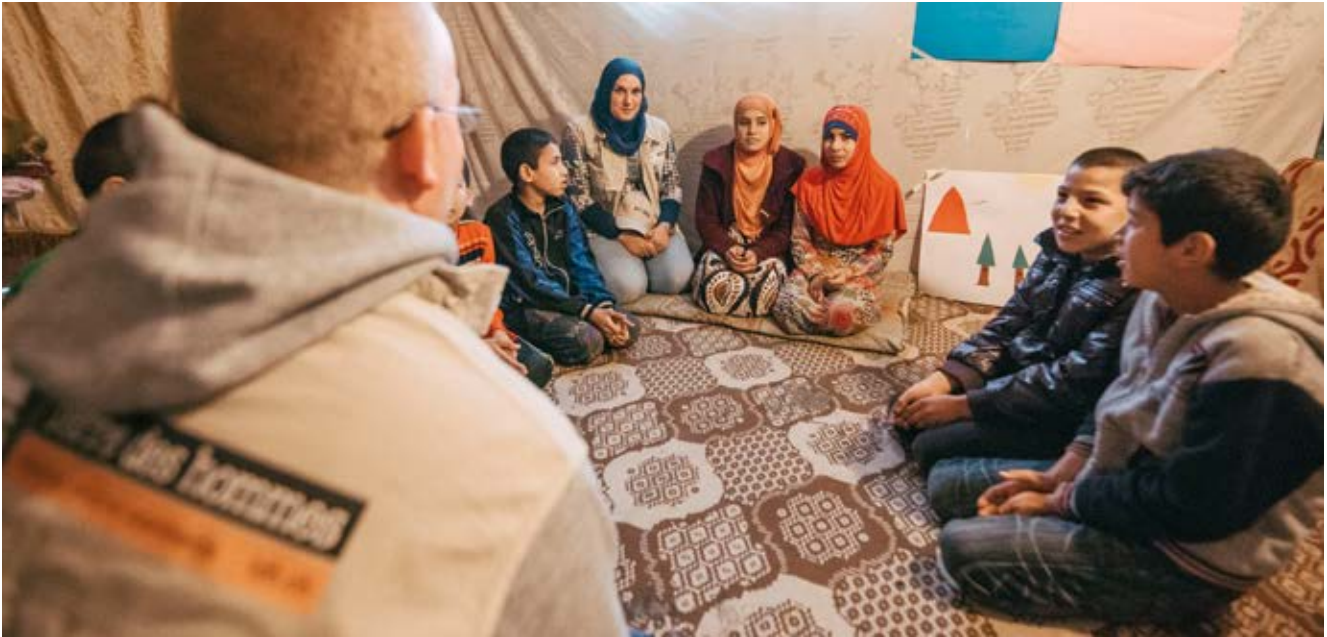
Libanon: support to a refugee family in a project of Terre des hommes Lausanne