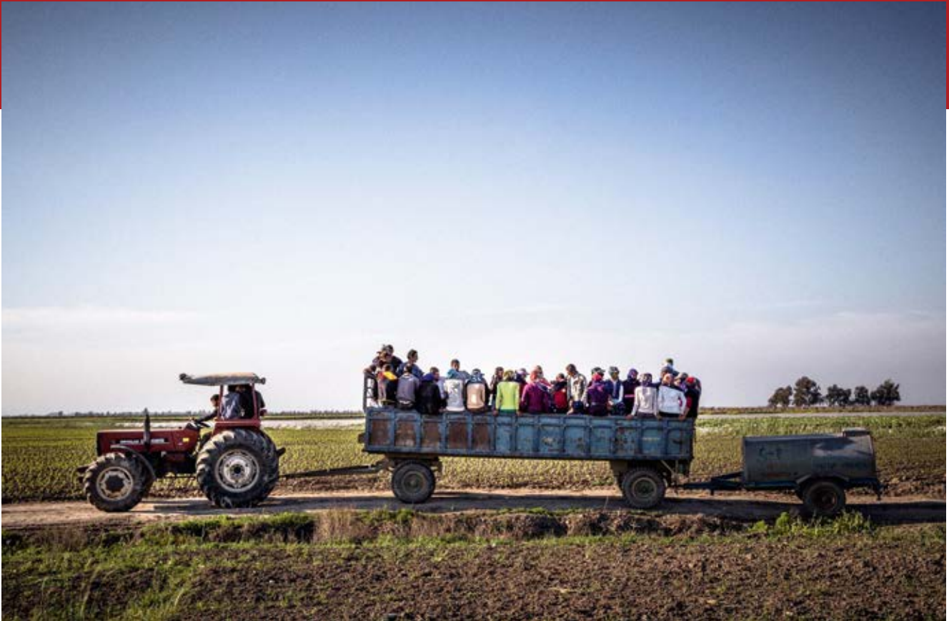
Turkey: on the way to the harvest

us then, because our father disappeared in Syria and as he was the oldest in the family he had to take care of us.» 206