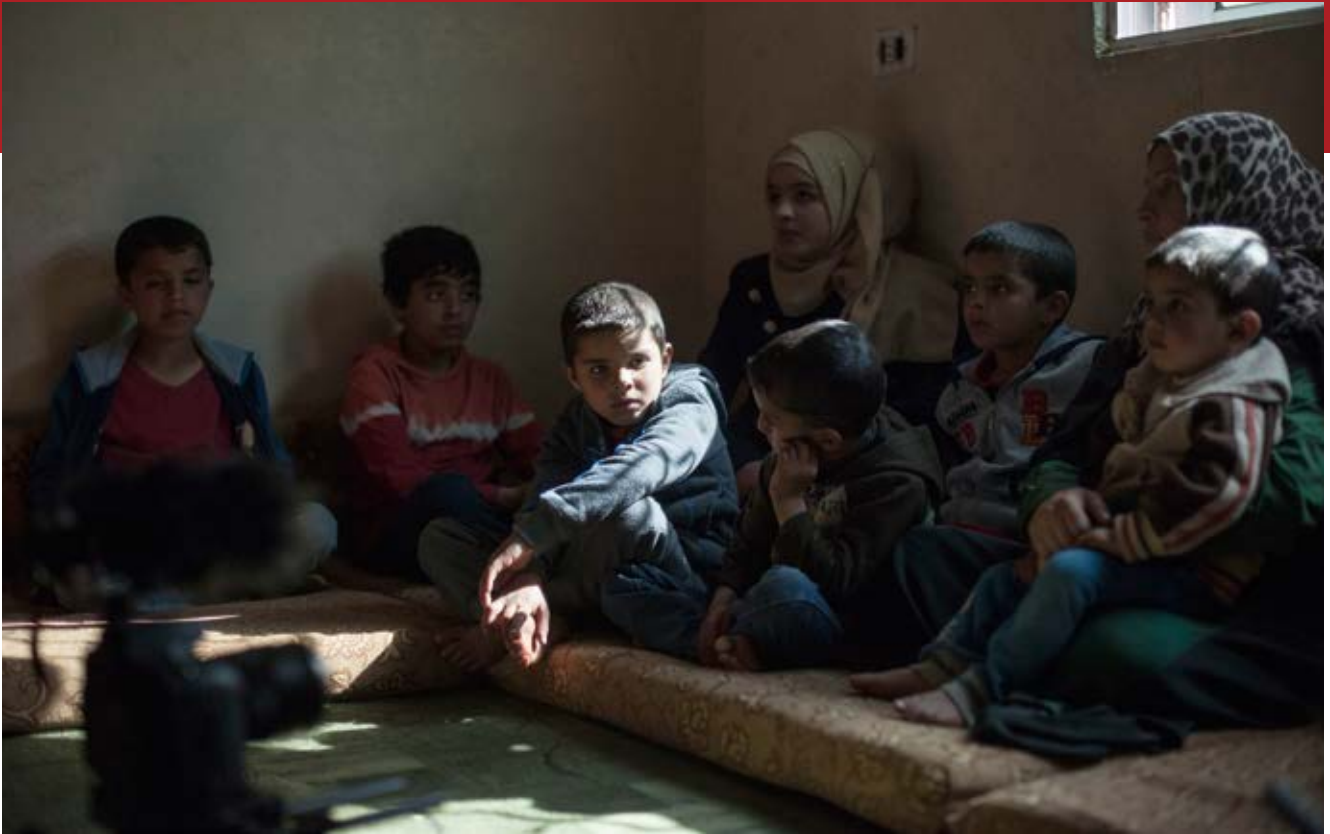
Bochar, 13 years old, works in an orchard in Jordan

ture, construction or service industries in the short term. However, access to the labour market for Syrian refugees is a highly sensitive issue in Jordan as only 36.3% of the local population aged 15 and above actually had employment in 2015. 73 The impact of refugees on the labour market has not been analysed to its full extent, but the coexistence of high levels of unemployment among Jordanian nationals and large shares of foreign workers has raised contentions. 74 Thus, the government is assessing opportunities to open some sectors to Syrian refugees without compromising the livelihood opportunities for Jordanians and other migrants.