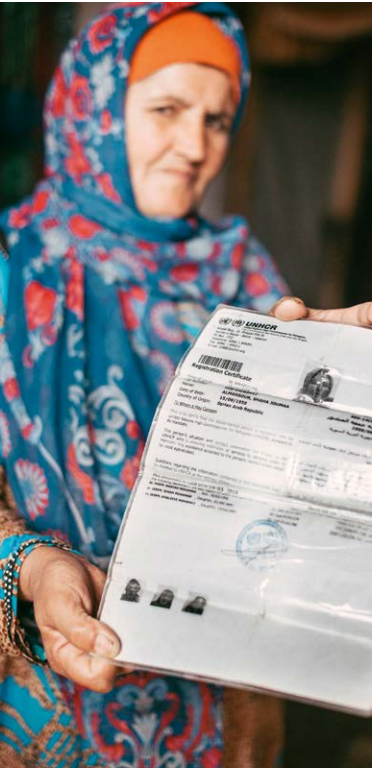
Together with her daughter she had to flee Syria in 2014

Within Syria, humanitarian partners providing assistance across the operational hubs (Syria, Turkey and Jordan) committed to work together under a »Whole of Syria« 24 approach at the end of 2014. 270 international and national actors have joined hands in this initiative to create a common response plan as well as a supporting coordination structure. This is aimed at reducing overlap in coverage and facilitating response by the direct and effective modalities of aid.