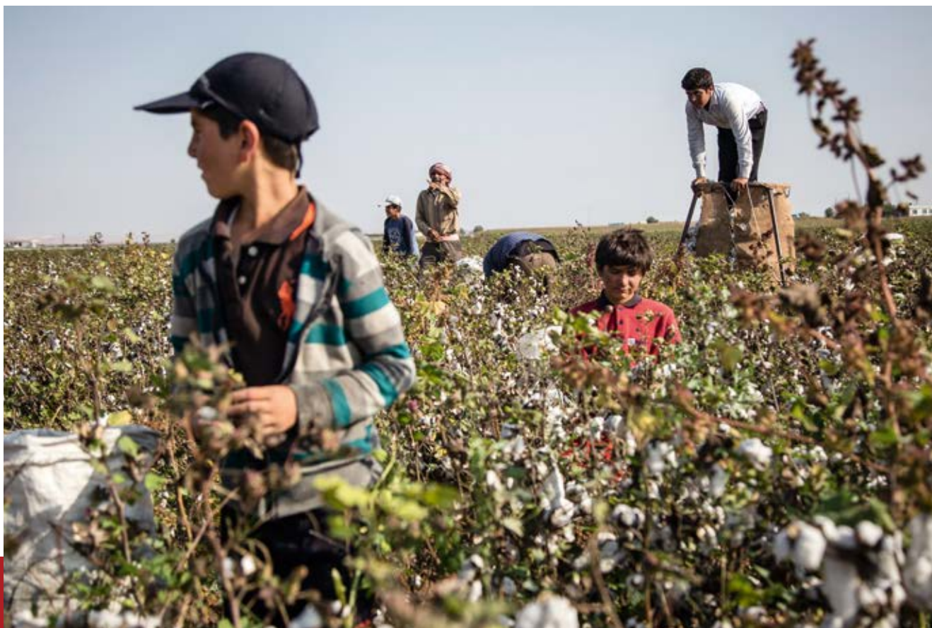
Turkey: children harvesting cotton