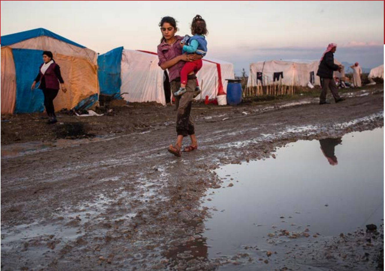
Refugee camp in Turkey

The EU provided the maximum possible amount of 930,997,848 EUR in December 2015 according to its ›Worldwide Decision‹ on financing humanitarian aid operational priorities. 28 With its recently updated contribution to the Syria Regional Crisis, the Humanitarian Implementation Plan (HIP) will now provide an additional amount of 130 million EUR in 2016 on top of its previous allocation of 330 million EUR to address the increasing humanitarian needs of displaced people and refugees in Syria as well as in Turkey, Lebanon and Jordan. 29 Finally, on 4 February 2016, the UK,