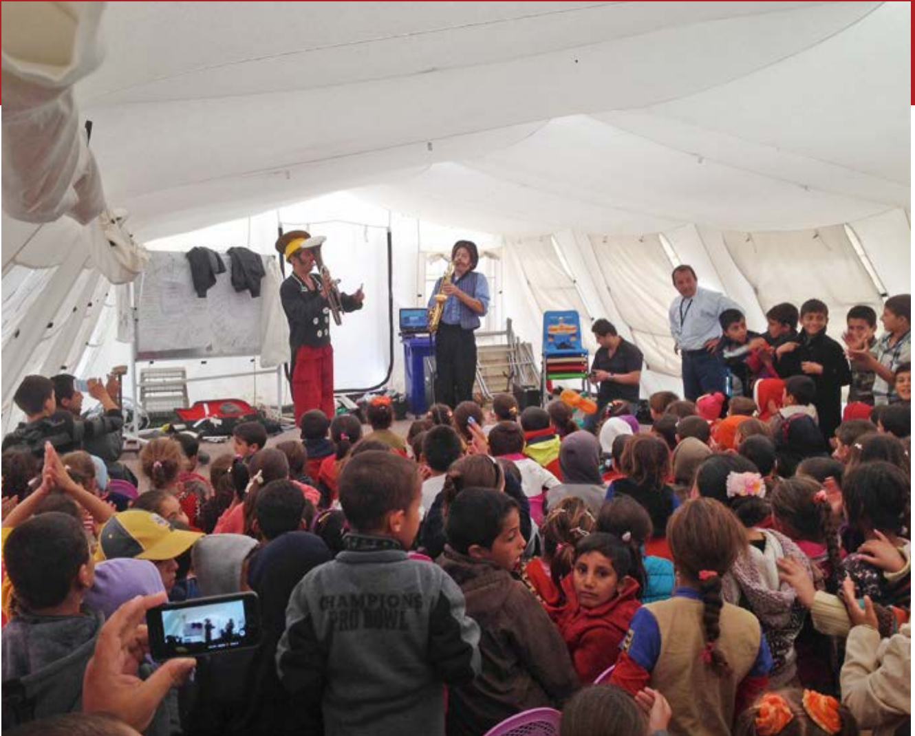
Children's amusement in a refugee project of terre des hommes Netherlands

money or food items, as well as marrying off a daughter to give her the chance to flee to a safer area or country with her husband's family and to survive with a wealthier family whilst saving on expenses for food for one family member. Moreover, accepting the recruitment of a child by armed groups, the flight to a more secure area inside the country or the flight to another country are all common strategies families develop in order to survive.