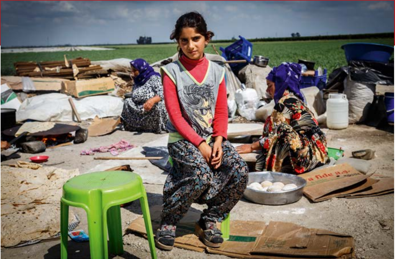
Turkey: Break from the field work. Young girl during the harvest.

8987/2012. 133 Applying these regulations in practice is difficult as »light work« is not defined in the Labour Code. Moreover, Art. 7 of the Labour Code excludes domestic workers and employees in the agricultural sector. 134