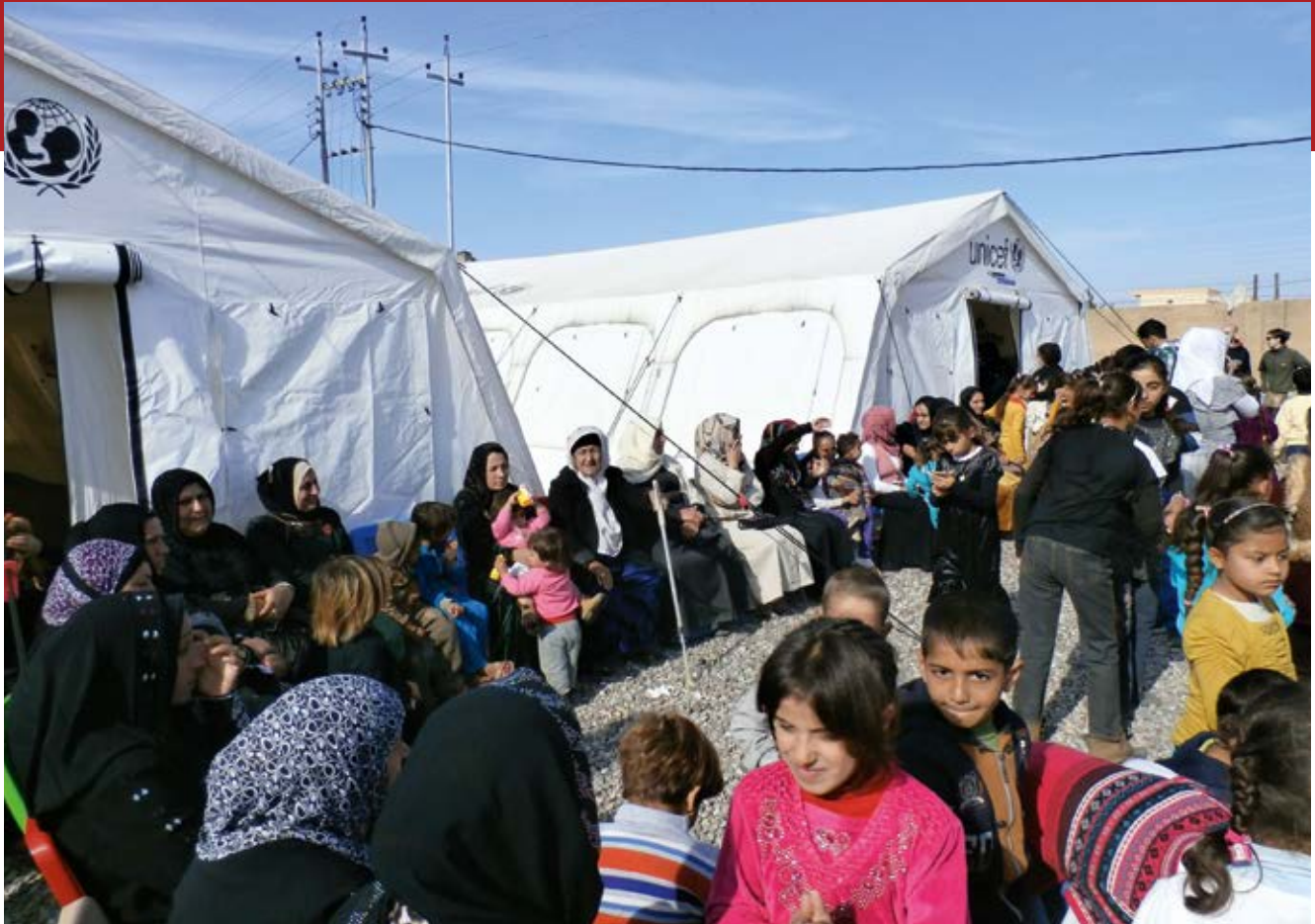
Refugee camp in Libanon