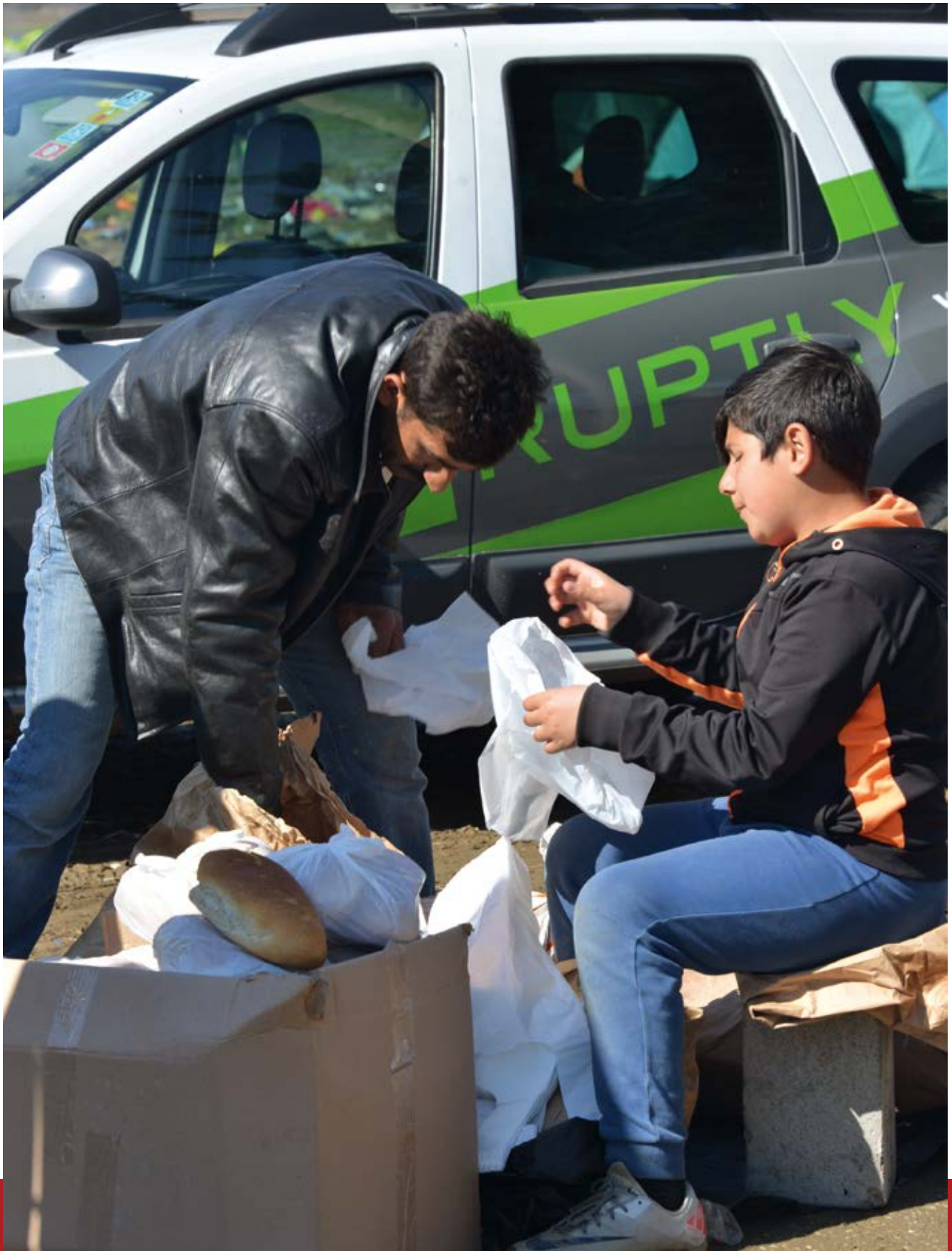
Greece: refugee child selling pastries in the street