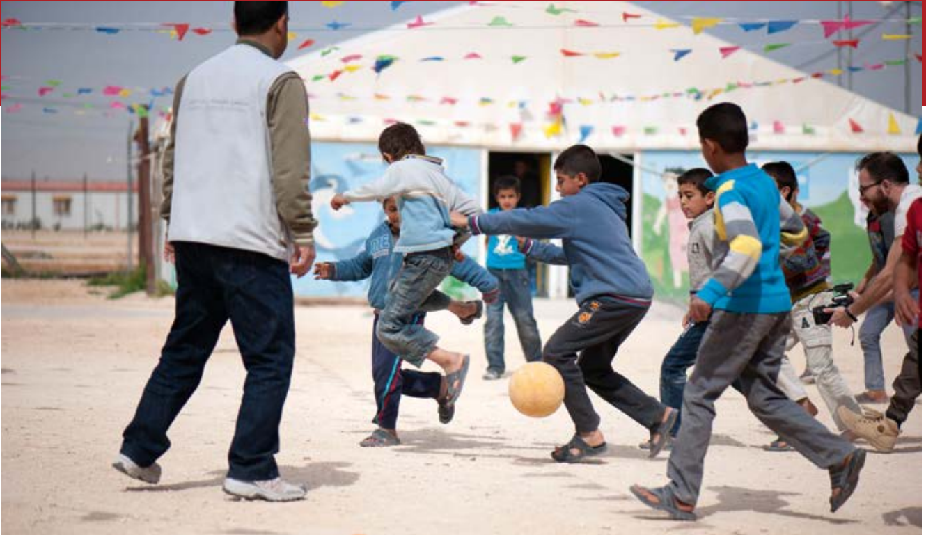
terre des hommes in Jordan: sport supports children in coping with traumatic experiences

Jordan – not only for Jordanian children but also for refugee children. However, access to school is difficult for many reasons. First, children are often withdrawn from school when sent to work. 89 Second, schools are often overcrowded and far away so that transportation costs can be a barrier. Third, a low interest level of the children for education, which has different causes, often prevents them from attending classes. Finally, growing tensions among local and refugee children, mentioned in interviews with the Terre des Hommes' North Field Coordinator, may cause school violence due to the lack of space and overcrowded classes 90 . This might also prevent refugee children from attending. Generally, a high necessity for social inclusion activities to achieve a greater integration of Syrian refugee children at school level and in their local communities and to encourage children not to drop out of school and to feel less discriminated has been identified by Terre des Hommes. Improving access to education can be seen as a decisive step in preventing child labour. Therefore, the NGOs are now trying to scale up non-formal education activities in order to promote and facilitate school enrolment.